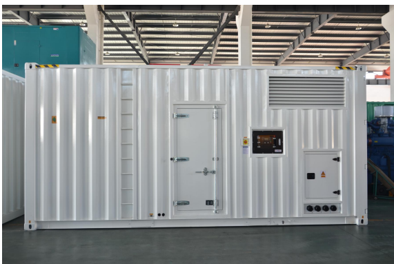
Dimension:6000*2400*2900mm Weight:12300kg Fuel Tank Capacity:1000-3000L