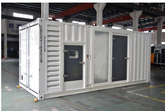
Dimension:6000*2400*2900mm Weight:12300kg Fuel Tank Capacity:1000-3000L